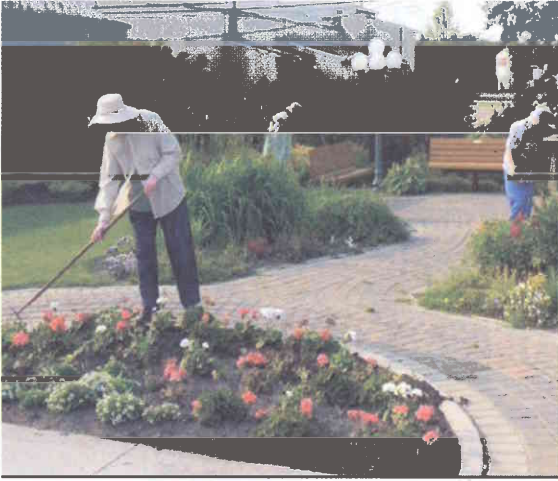
Summer is just around the corner...